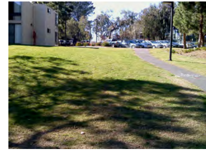
6. Marshall Lowers Apartments