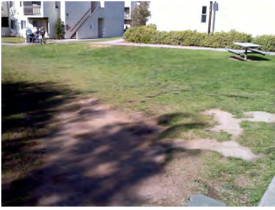
1. Marshall Field