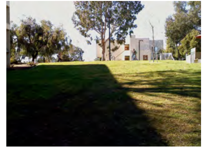
4. Goody's Market Lawn