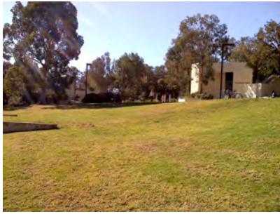
3. Across from Marshall Administration Building [Preferred site location]