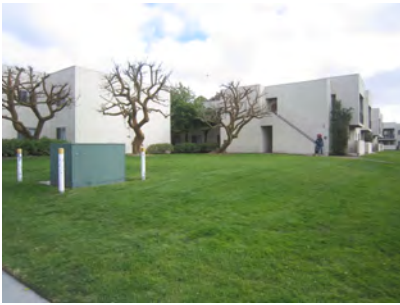
5. Marshall Uppers Apartments