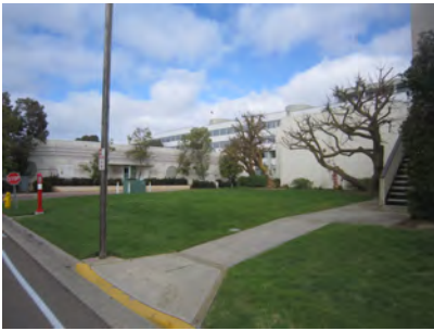
5. Marshall Uppers Apartments