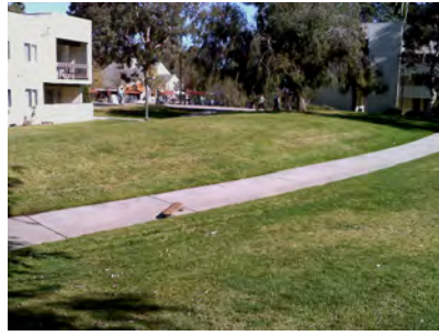
2. Marshall field North Hump