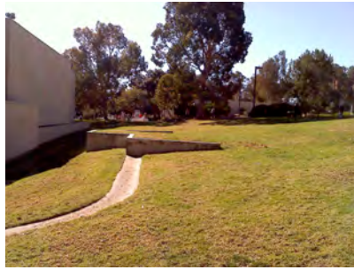
3. Across from Marshall Administration Building [Preferred site location]