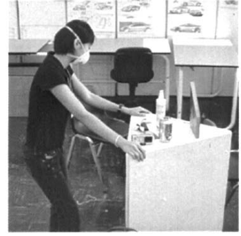
Fig. 1. Storyboard example from cart project.

Visual storyboards can also be used to help designers identify opportunities for innovation. The operational process for a common electrical kitchen product may be: