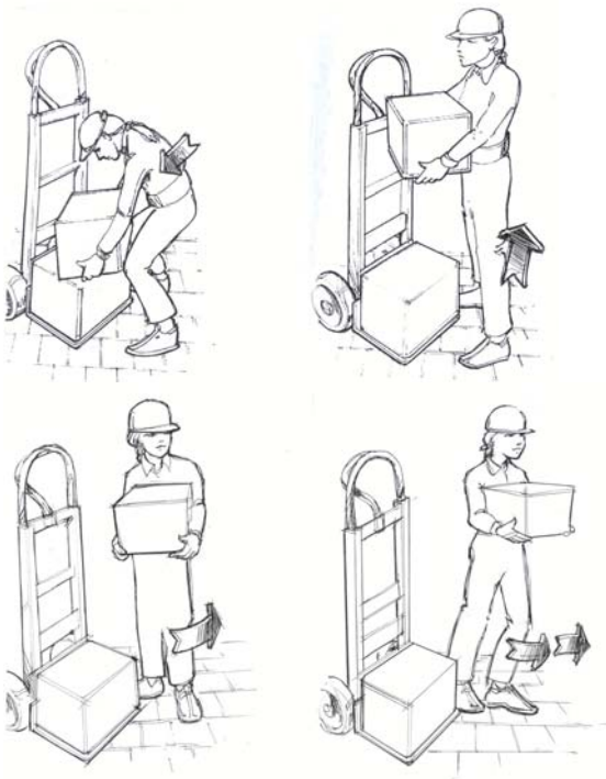
Fig. 3. Storyboard from hand truck project.