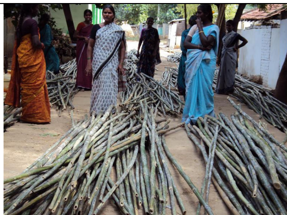
The Bamboo sticks.