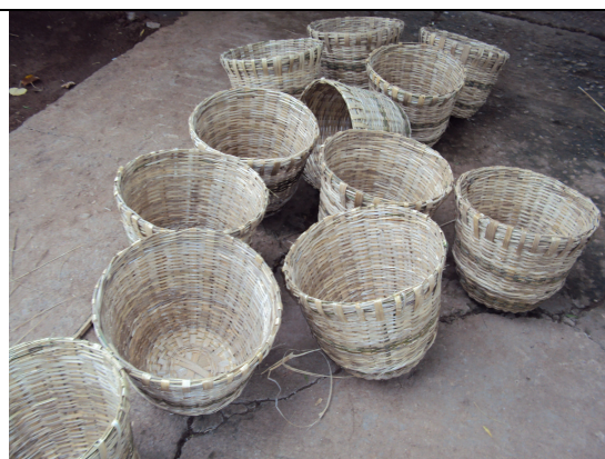
Small size bamboo baskets