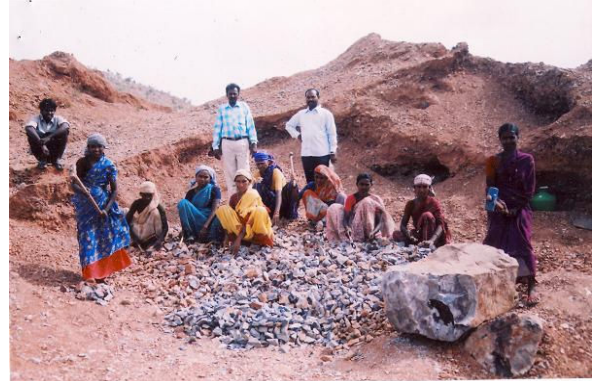
The widows are working under hot sun in the quarries and doing stone breaking work for making the gravel.