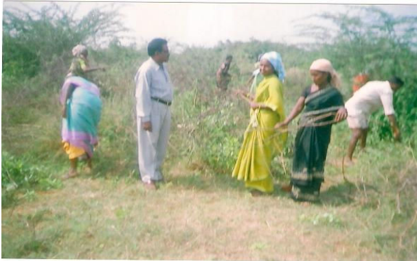
The widows are working as labours in the jungle clearing under the hot sun

Their problem is that they do not have permanent livelihood source. Now these widows are working as seasonal labourers for example agriculture labours, quarry labours, masons and as housemaids etc., just busy yearly 3 months, that too competitive to get work. They are lacking work opportunities in these drought prone areas.