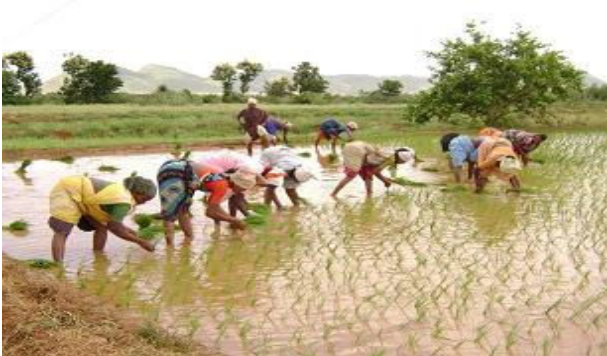
The Widows are working under the hot sun in the agriculture fields.