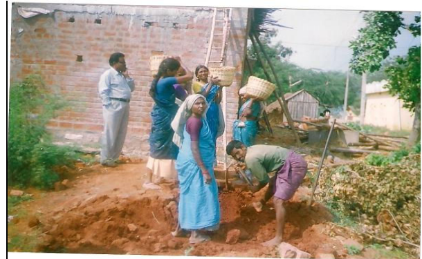
The widows n are working as labours in the construction spot under the hot sun.

In order to eradicate the hunger and poverty among these widows in our target villages we have planned to implement the income-generating programme for the survival target group widows families.