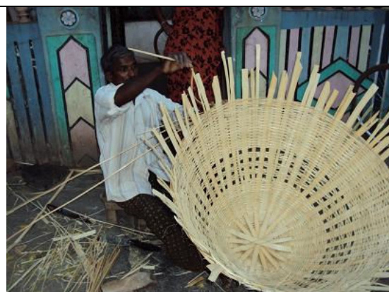
Big size Bamboo baskets

Here bamboo baskets are used to carry over head or on the shoulder or by hips filled by some vegetables and/or fruits and/o groceries. Labour people use the baskets to carry on sand or soil or pieces of brick or pieces of gravel etc., in the work spot such as agricultural fields or at construction places, firms, factories etc., the baskets are used in the houses also. The baskets are used commonly in the rural area by the middle class and below middle class people in India which is gigantic with more than 70% geographical areas into itself.