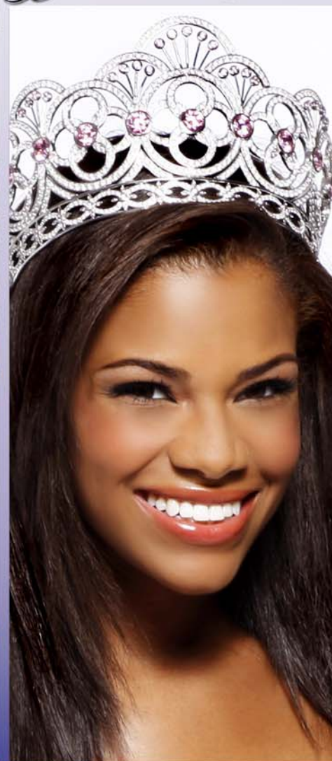
Kamie Crawford MISS TEEN USA® 2010 Maryland