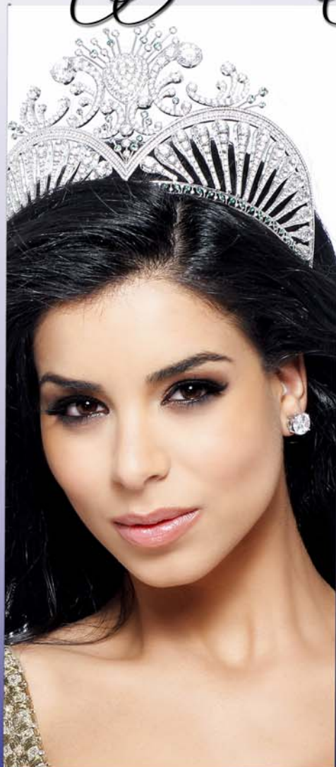
Rima Fakih MISS USA® 2010 Michigan