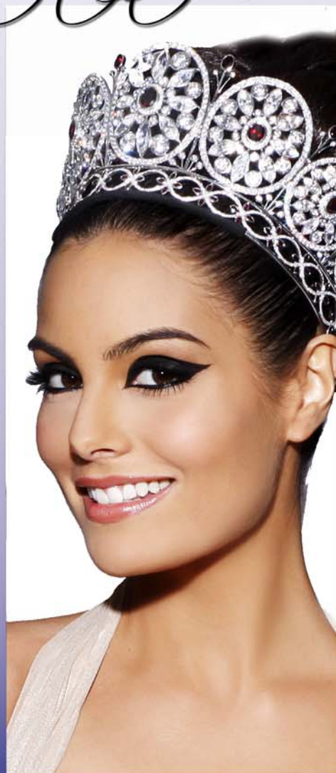
Ximena Navarrete MISS UNIVERSE® 2010 Mexico