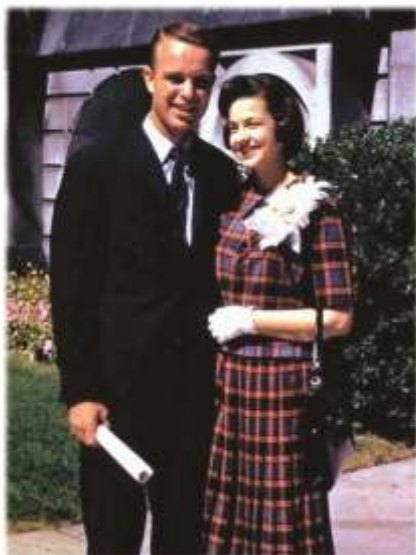
MARRIED ~ SEPTEMBER 15, 1958