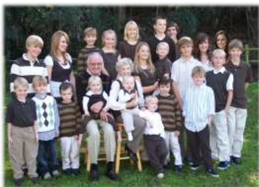
NEW YEARS DAY 2009