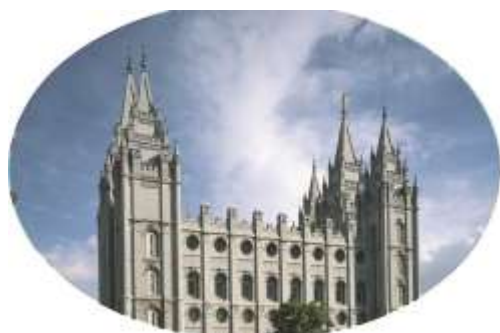
FAMILIES ARE FOREVER