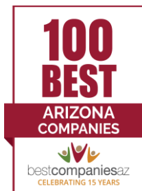
100 Best Award/Charity