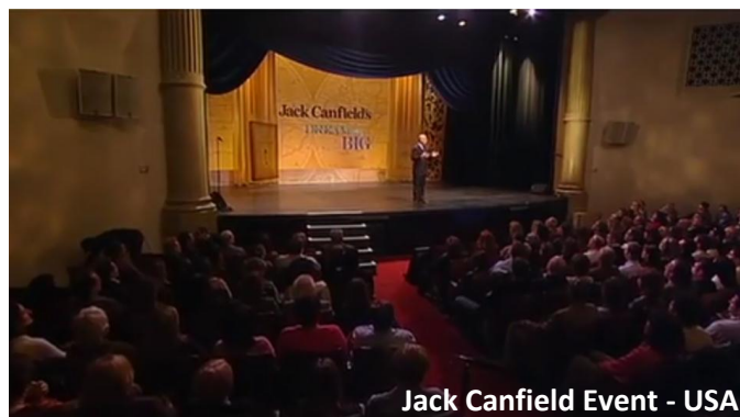
Jack Canfield Event - USA