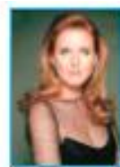
Sarah Ferguson (Duchess of York)