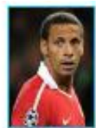
Rio Ferdinand (Manchester United)