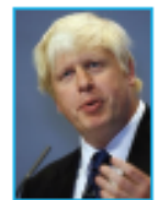
Boris Johnson (Mayor of London)