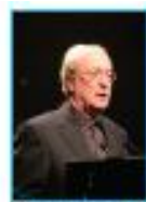
Sir Michael Caine (Actor)