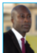
Ozwald Boateng (Fashion designer)