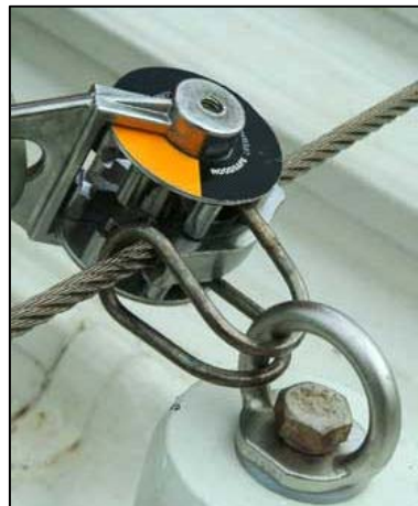
The “Lifewheel” travelling anchorage. Schematic diagram (left) and typical application with installed lifeline (right).