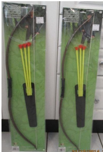
Robin Hood bow & arrow