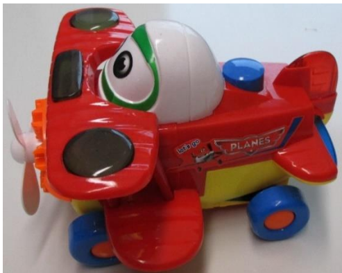
Chupacabra dancing planes bump N go No.901-85