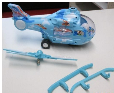
Blue helicopter No. 268