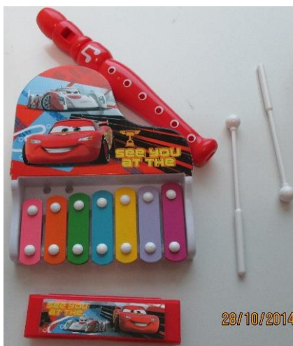
Series music see you at xylophone & recorder