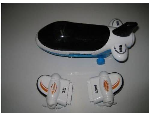
Aircraft disco music & flash light No. 8328