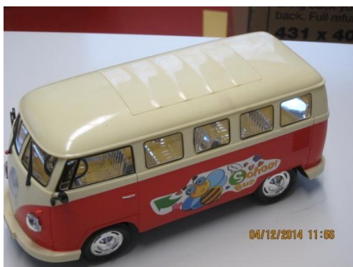
Busset happy everyday happy time