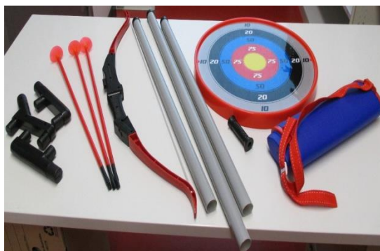
Archery set enjoy the sport fun No. YG13L