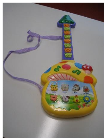
Fungus music guitar No.5017B