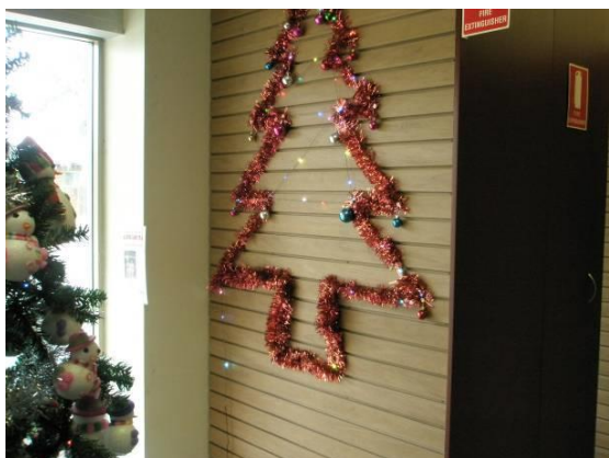
Unmarked power supply (Sold with Christmas Tree)