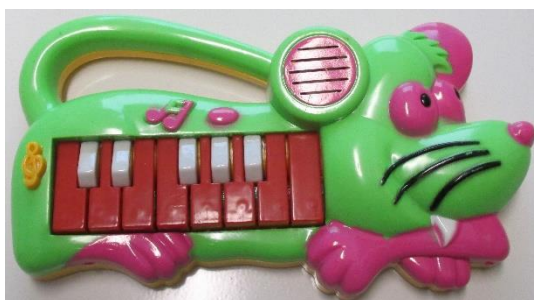
Musical green and pink mouse piano No EG71772