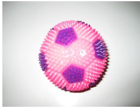
Pink/purple squeaky ball