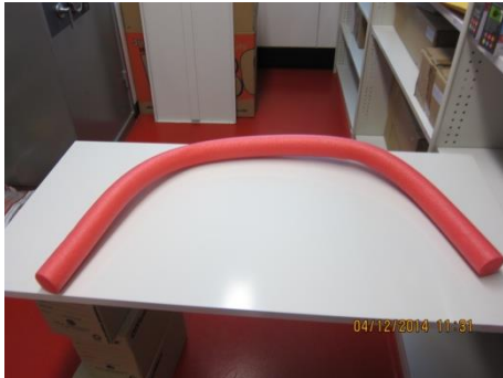
Pool noodle – no warning