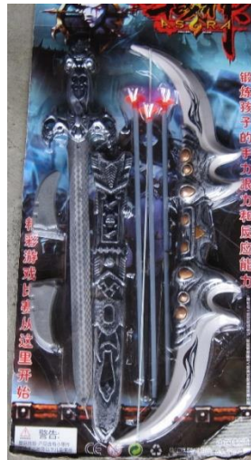
Asra bow and arrow medium size bow