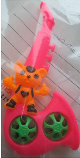
Pink trumpet & orange bear rattle No. NRD 13012