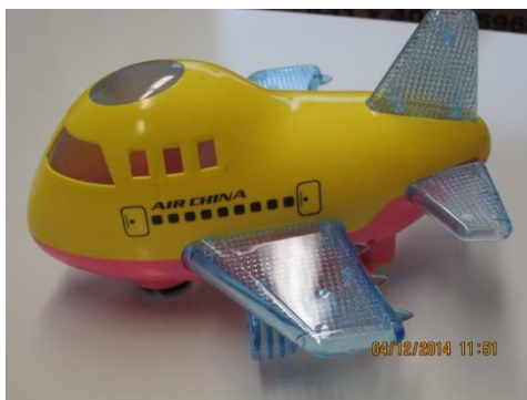
Air craft cool toys No. 198A