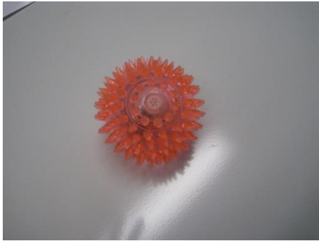
Orange spikey squeaky ball