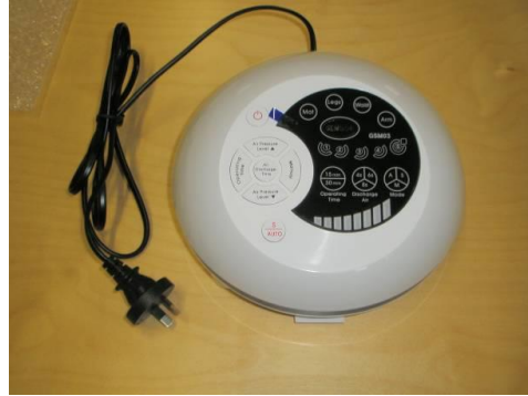
Unmarked Massage Appliance