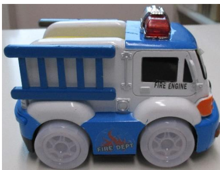
Blue fire engine No. 777-7