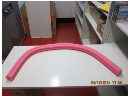
Pool noodle – no warning