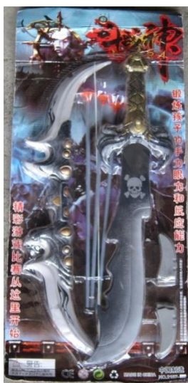
Asra bow & arrow medium size sword