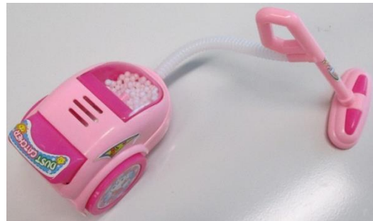
My home mini household set dust catcher No.818B