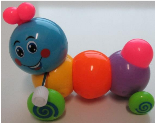
Caterpillar wind up toy