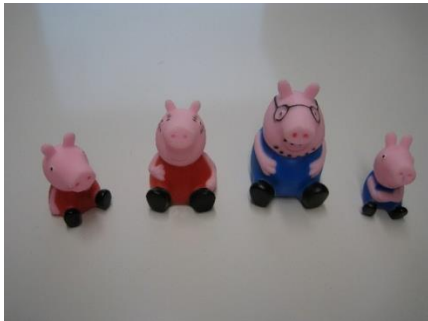
Peppa pig –peppa & family squeaky toys PP6002