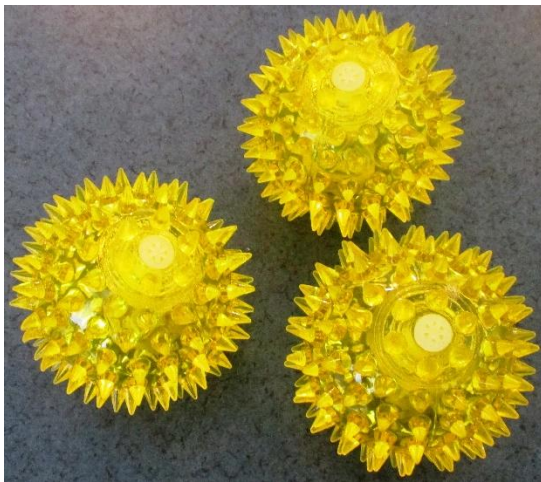
Yellow light up spikey squeaky balls