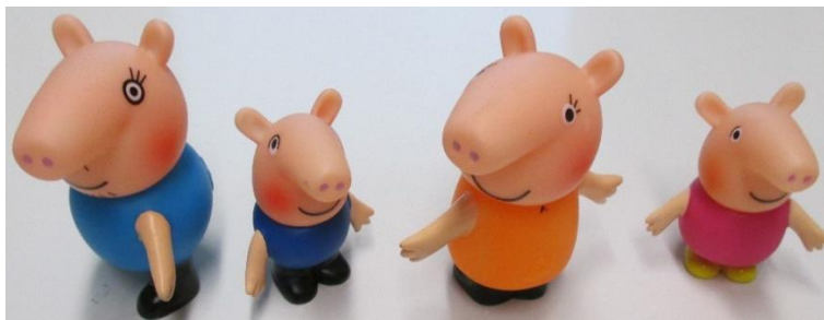
Peppa pig and family particularly interesting little story squeaky toys