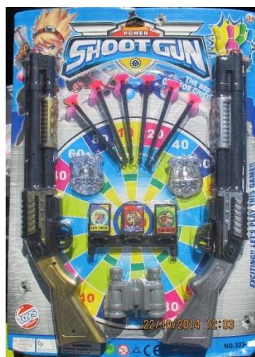
Power shoot gun No. 635-3