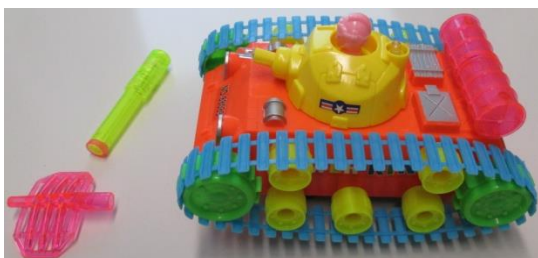
Funny tank bump n go No.88089