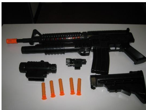
Super combat super gun No. TD2011AAA