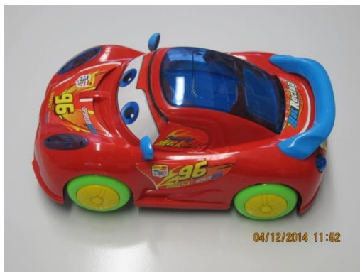
Cartoon likeability music car – cars 2 No.288-4