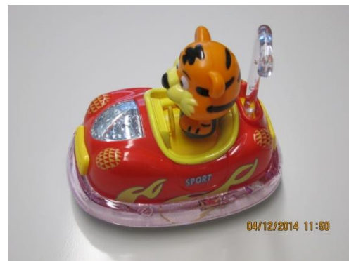
Bumping Car go action MTTTOYS No.2058C