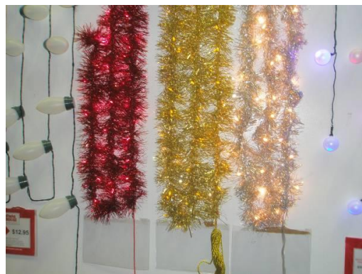
Unmarked Christmas Lights (Tinsel cord)