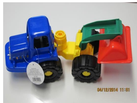
Blue truck with scoop No. JH5-008