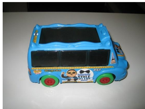
Gangman style dream bus No. XZ067