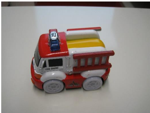
Red fire engine No. 777-7