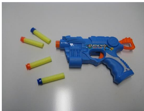
Shoot soft gun No.9585282226580