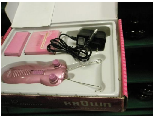
Unmarked power supply (sold with hair care equipment)