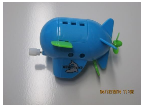
Peculiar wind up toy