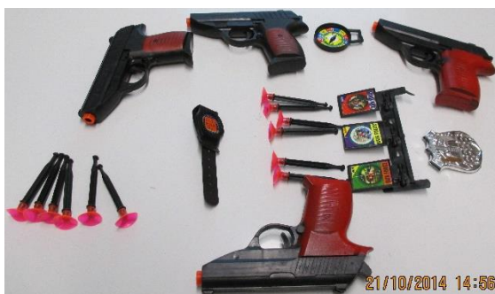
Super gun police No.0209