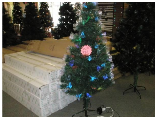
Unmarked power supply (Sold with Christmas Tree)