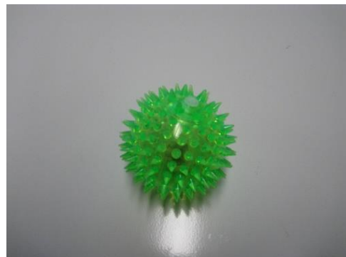
Green spikey squeaky ball