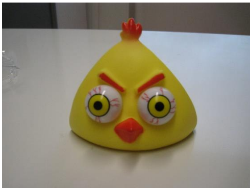
Yellow angry bird squeaky toy