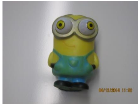
Yellow/blue minion squeaky toy