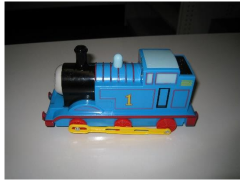
Thomas & Friends talking Thomas N0.88228