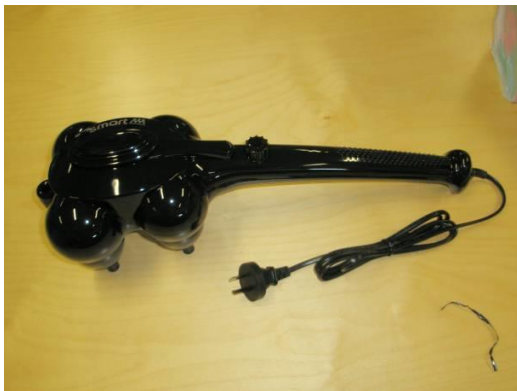
Unmarked Massage Appliance