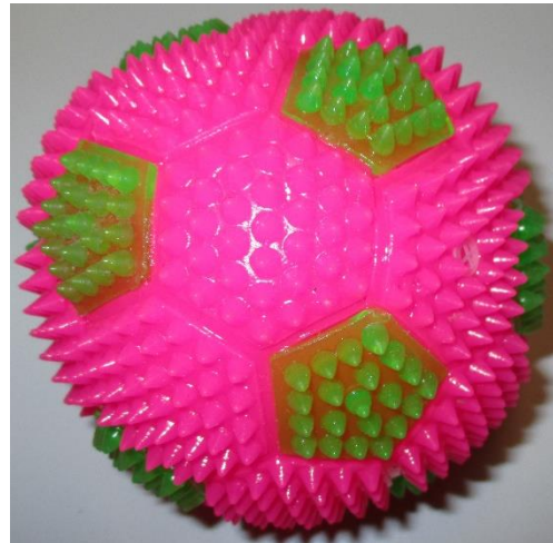
Green pink squeaky ball