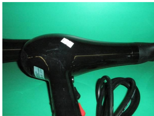
Unmarked hair care appliance (Hair Dryer)