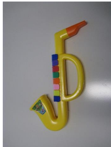
Happy band saxophone KD 2004