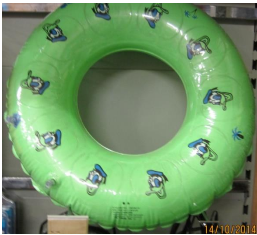
Swim ring – no warning