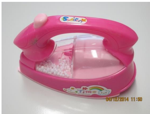
My home mini household set iron No.818C