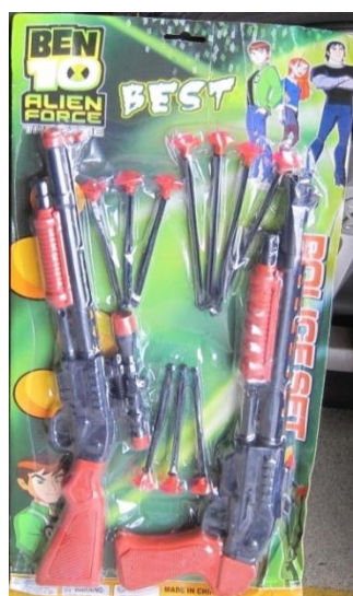
Ben 10 Alien force