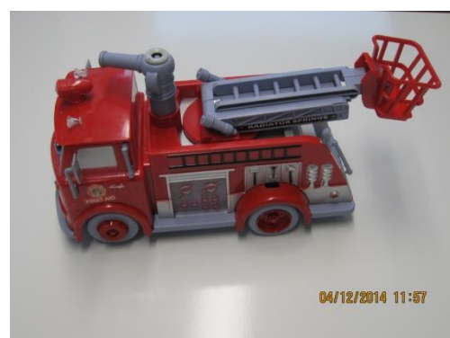
Fire rescue pumper No. B838B