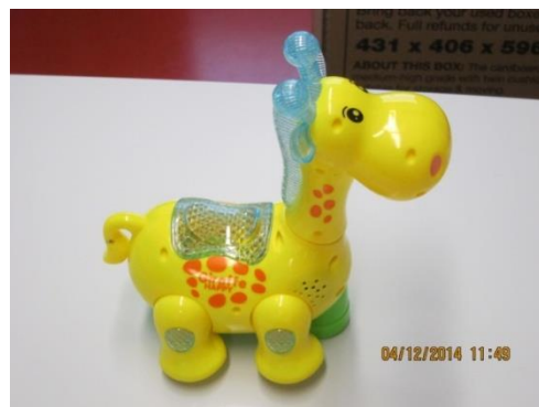
Giraffe projection flash electric No.LX311