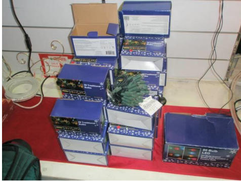
Unmarked Christmas lights