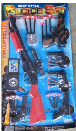
Best style police set powerful