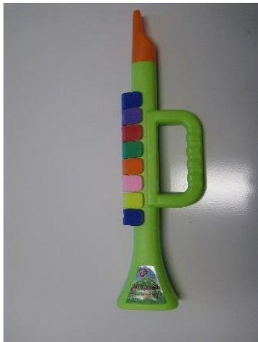
Happy band philharmonic trumpet 199-A KD