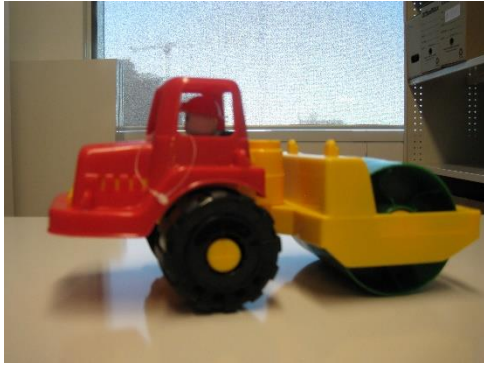
Red truck with roller and driver JH5008