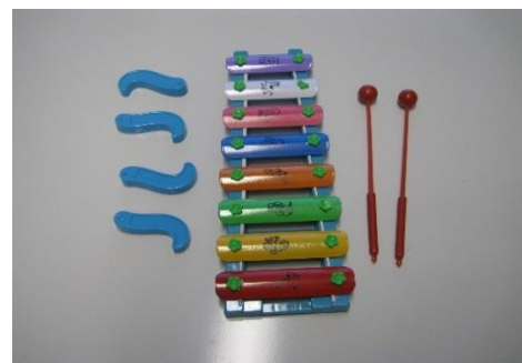
Knock piano xylophone No. 3342B