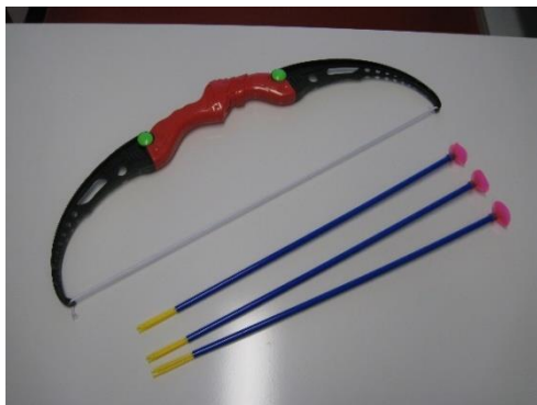
Spiderman bow & arrow 1925 – 1927