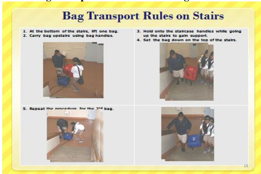
Figure 1 Bag Transportation from Training Materials