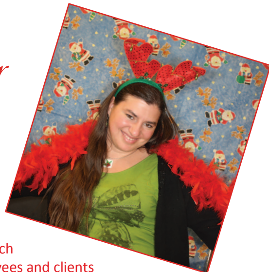
Outreach employees and clients at the Coffee House Social