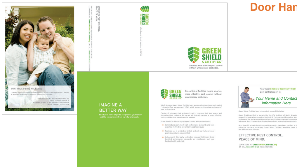
Outside (left) and Inside (right) panels of the "Imagine A Better Way" trifold Brochure.