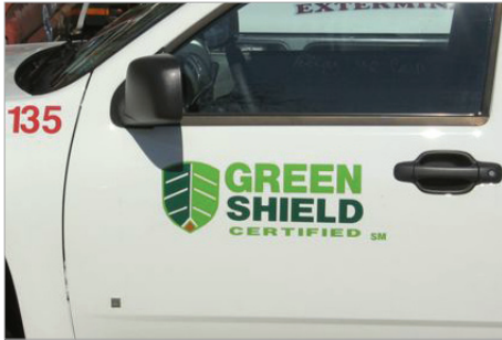
Standard semi-permanent Green Shield Certified vehicle decal. Magnetic and customized decals are available.

Green Shield Certified vehicle decals are a great way to advertise on the go! Magnetic decals can be placed, moved or removed at your discretion. Semi-permanent adhesive decals are applied once and can be permanently removed without scratching your paint. These decals are perfect for turning rush hour into a marketing opportunity!