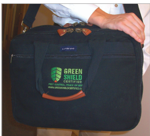
Green Shield Certified laptop attaché. Customized laptop attachés are available.

Take the Green Shield Certified name with you using this embroidered laptop attaché. This durable canvas and leather-trimmed laptop carrier features a padded laptop compartment and an adjustable shoulder strap. All attachés display the Green Shield Certified logo. Customize attachés with your certified company or service name and/or employee's name.