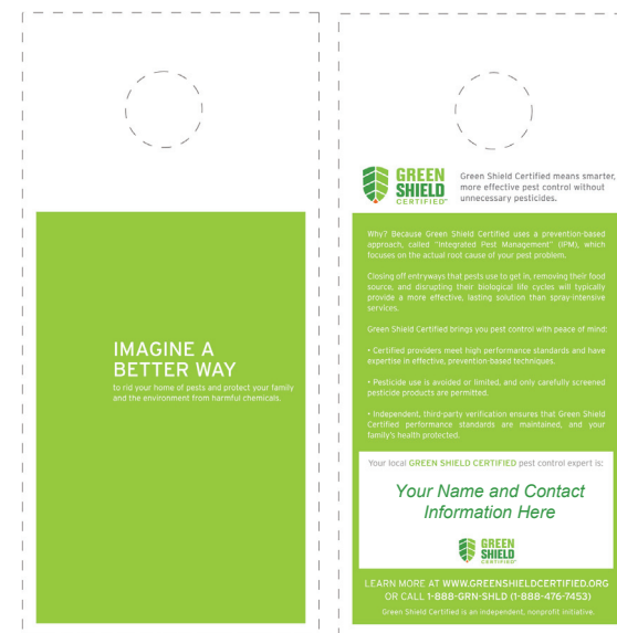
Front (left) and Back (right) of "Imagine A Better Way" Door Hanger.