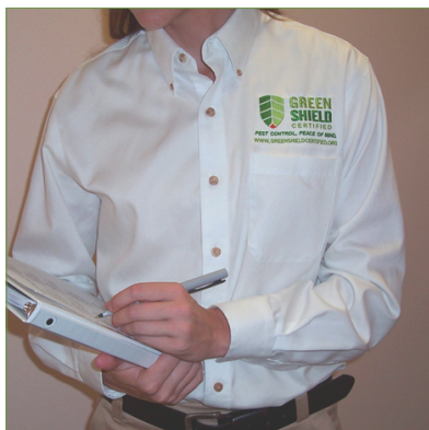
Green Shield Certified long-sleeved shirt. Customized shirts are available.

Green Shield Certified long-sleeved shirts are 100% cotton twill, no-iron and stain-resistant. Logo appears above left breast pocket. Prices vary depending on size and location of logo and name.