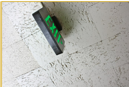
Glued On Acoustic Tile