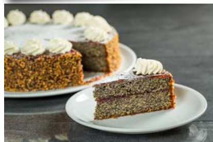
Poppy Seed Cake