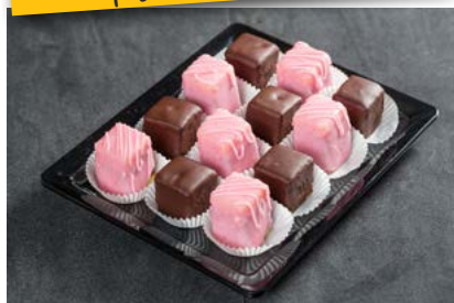
Sacher and Punch Cubes