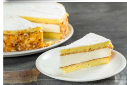
Sweet Cheese Cake